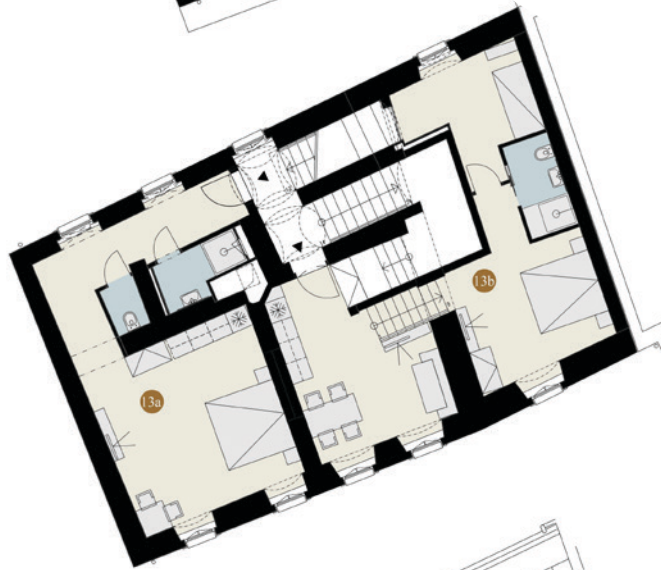
Level 2 S13a & S13b