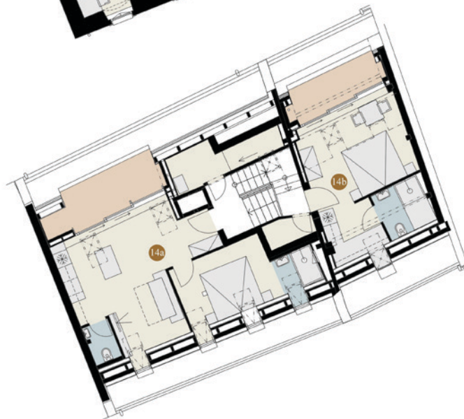
Level 3 S14a & S14b